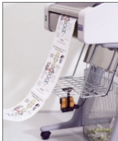
on-line connection to printer