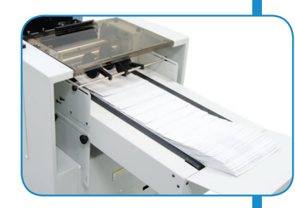
24" outfeed conveyor helps keep forms in a neat order after processing